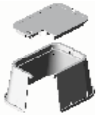
PLASTIC VALVE BOXES